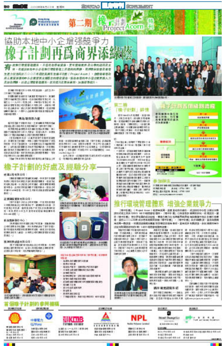
Supplement on Sing Tao Daily